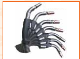
Fig. 3 – Innovative Welding Torch