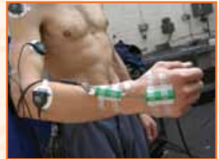
Fig. 1 – Ergonomic Research under the Econweld Project

EFW (PT) / NIL (NL) / MHTe (HU) / RIPH (PL) / DVS-FV (DE) / ValkWelding (NL) / Inovamais (PT) / Almor (UK) / Jesva (CZ) / ETP (SK) / Aspirmig (IT) / IIS (IT) / IR JB van den Brug (NL) / MS di Mauro Sala (IT) / Plasma Team (IT) / DIMEL (IT) / CFD Engineering (IT) / IST (PT) / IS (PL)