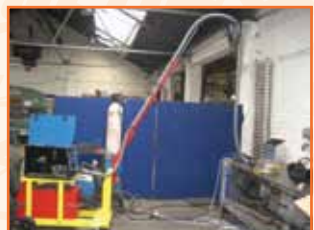
Fig. 4 – Welding Arm improving Welding Process